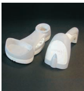
Clockwise from left: Gryphon™ Stand, Desk holder, Gryphon™ OM